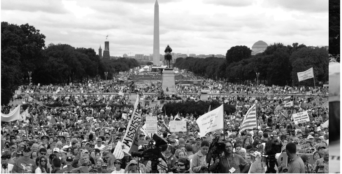
Scenes from the September 12, 2009, March on Washington.

thousands of Americans have become true leaders in their communities, organizing protests and town hall meetings, lobbying their state and federal legislators, and leading get-out-the-vote efforts for limited-government candidates in elections.