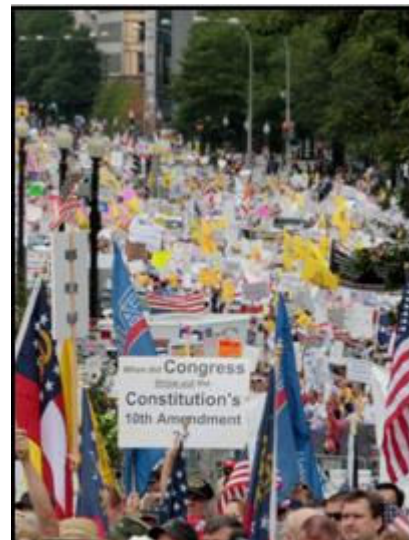
9-12 Taxpayer March Participants Streaming Down Pennsylvania Ave. in 2009