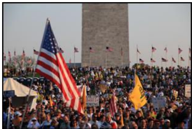
Thousands of Activists came to Protest Against the Obama Agenda at the D.C. Tax Day Tea Party

Having exponentially grown our community, leading into November we will be poised to effectively engage in concentrated Get Out the Vote (GOTV) activities and drive key issues in critical House and Senate battleground elections. To fully capitalize on the ability to conduct GOTV activities, we will launch the Freedom Project , which includes direct issue education against the backdrop of a targeted congressional race. We will also develop Candidate Scorecards that compare the policies advocated by each candidate and the impacts they will have on consumers' pocketbooks, businesses, and ways of life, and help activists Shadow Key Congressional Candidates as they make their way through our target states, questioning them concerning their views on key political issues. All of these efforts must be bolstered by an ongoing earned media and internet-based marketing campaign.